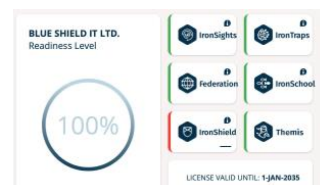
3 - IronScales- Anti-Phishing Platform.